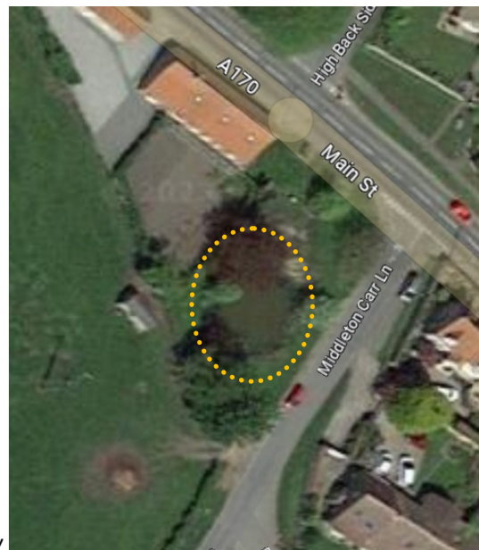
Pond location/satellite view